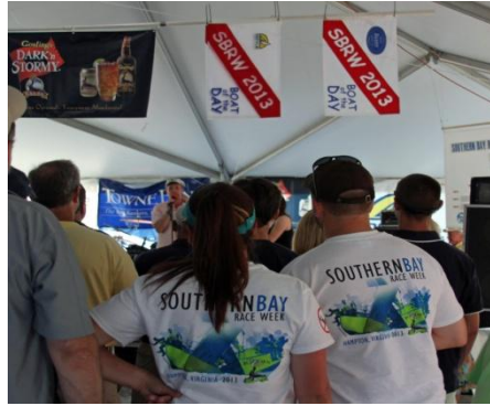
SBRW official T-shirt are popular sailing attire