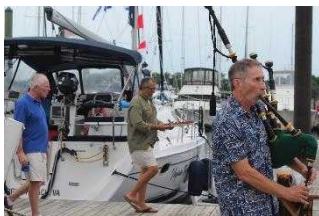
The Pied Bag Piper of Cape Charles

was a great night to be anchored. A persistent light breeze made for a comfortable night's sleep. But that would soon change.