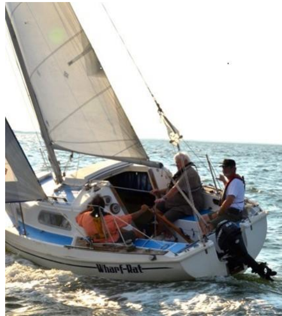
An old photo of the Rat with the bone in her teeth

https://www.facebook.com/groups/250807138384289