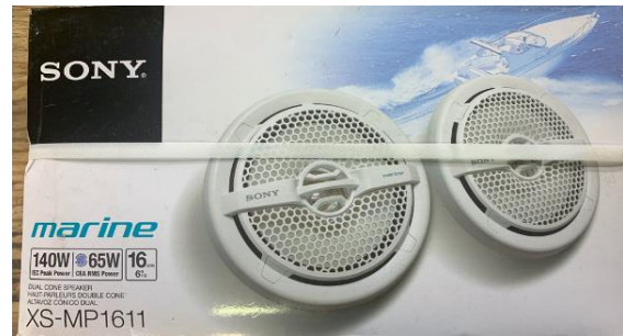
Pair of Sony Marine 140W Stereo Speakers, $60.