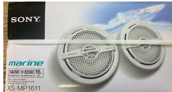
Pair of Sony Marine 140W Stereo Speakers, $60.