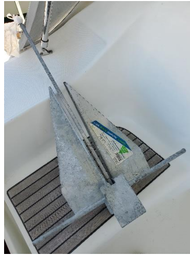
25 pound Danforth anchor. Came with the boat when we bought it. Never used as evidenced by the intact label plate. New costs roughly $140. I'm good at $40... OBO