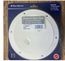
West Marine 6 inch Deck Inspection Plate, $10.