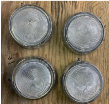
6-inch White light Stainless Steel Cabin Dome Lights, $45 set or $15 each.

Jonathan Romero has a lot of items for sale: