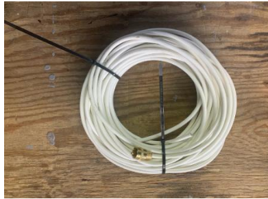
75 feet coaxial cable RG-59U with PL-259 connector, $85.