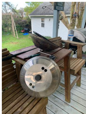
Magna Round Charcoal Grill with Rail Mount, $25.