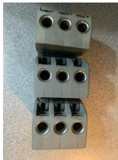
Spinlock 3-gang Clutches, 6-8mm line size $175.00 for 3, or 75.00 each.