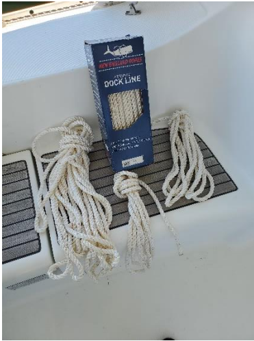
1/2" Dock line never used. 1 50' line left. $25 OBO

Contact info is karl.shulenburg@gmail.com or (757) 374-6034.