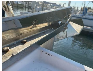
33 lb stainless steel anchor- $250.00