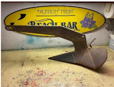
33 lb galvanized anchor- $175.00