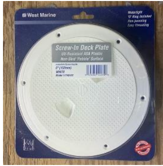
West Marine 6 inch Deck Inspection Plate, $10.