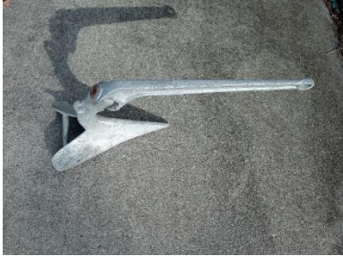
30 lb CQR galvanized anchor- $50.00

Jack Clayton has an anchor for sale jgc@melantho.com