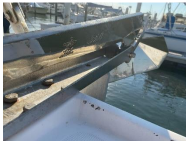
33 lb galvanized anchor- $175.00 33 lb stainless steel anchor- $250.00