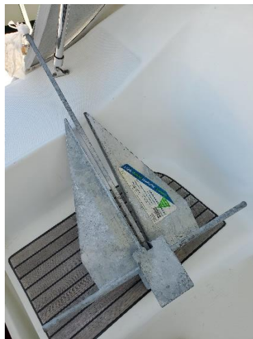
25 pound Danforth anchor. Came with the boat when we bought it. Never used as evidenced by the intact label plate. New costs roughly $140. I'm good at $40... OBO