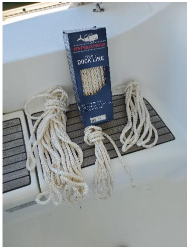
1/2" Dock line never used. 1 50' line left. $25 OBO

Contact info is karl.shulenburg@gmail.com or (757) 374-6034.