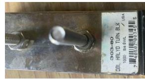
3 Series Double Deck Organizer. Sheaved for 11mm max line, $35.