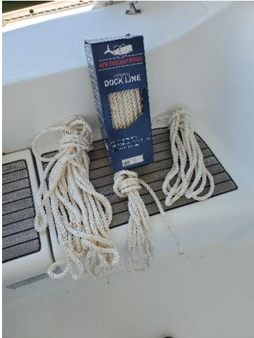
1/2" Dock line never used. 1 50' line left. $25 OBO

Contact info is karl.shulenburg@gmail.com or (757) 374-6034.