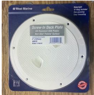
West Marine 6 inch Deck Inspection Plate, $10.