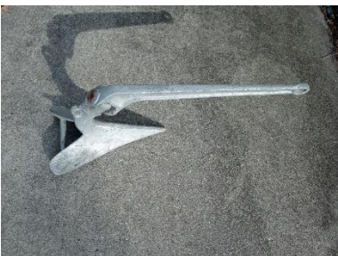
30 lb CQR galvanized anchor- $50.00

Jack Clayton has an anchor for sale jgc@melantho.com