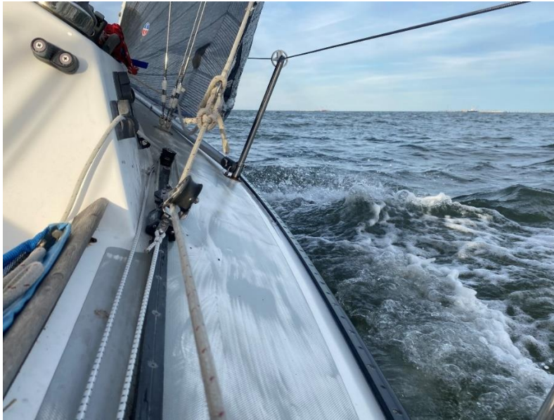
Creek Water with the Bone in her Teeth

The summer series is done... The Oktoberfest Series has begun. Race 1 in the books. A toasty evening with 14 boats signed up, and 12 boats competing... what a ride. Fall racing at The Creek.