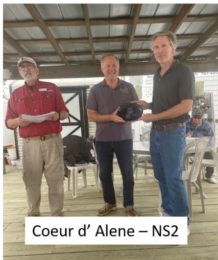
Coeur d' Alene – NS2