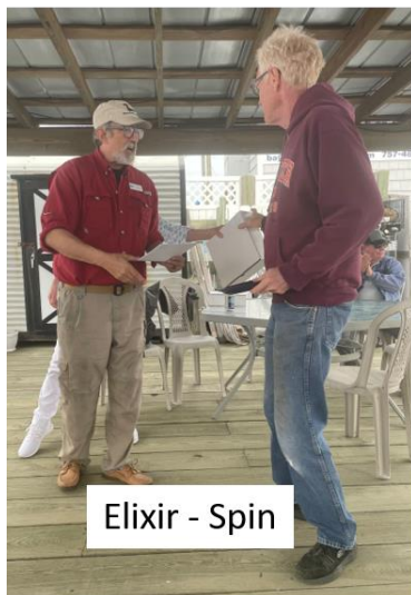
Elixir - Spin