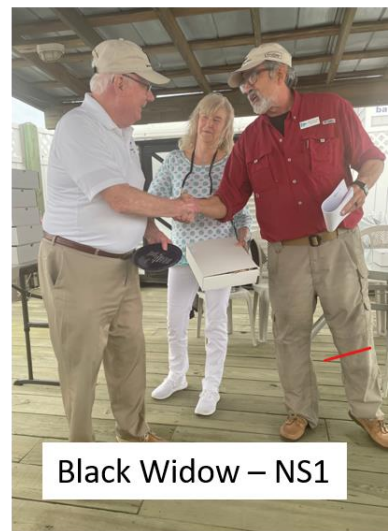
Black Widow – NS1