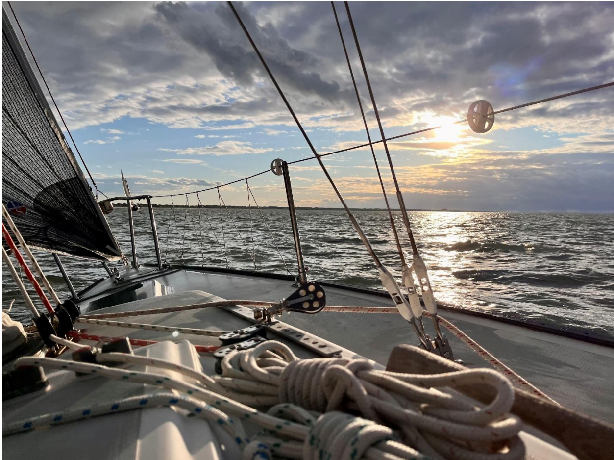
Series 1 / Race 5 - Photo Credit: Erhan Atasoy

And the LCSA Series 1 Winners are: NS1, Black Widow; NS2, Brittany, and SPIN, Elixir. Way to go Little Creek.