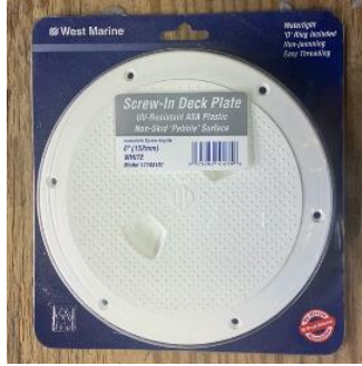
West Marine 6 inch Deck Inspection Plate, $10.