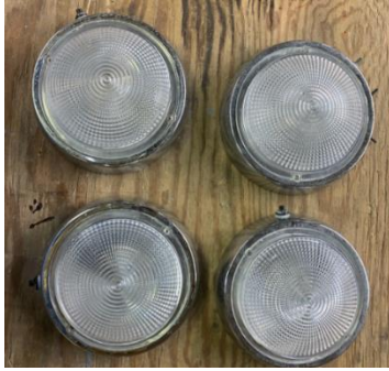
6-inch White light Stainless Steel Cabin Dome Lights, $35 set or $5 each.