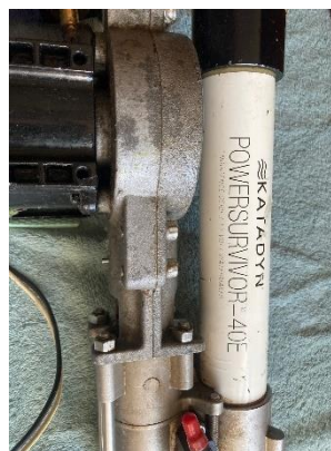
Watermaker: Karadyn 1.5 gal/hr Powersurvivor 40E used with prefilter, 4 filters and pickling chemicals - $1,500