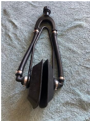
Outboard wash out ears - free