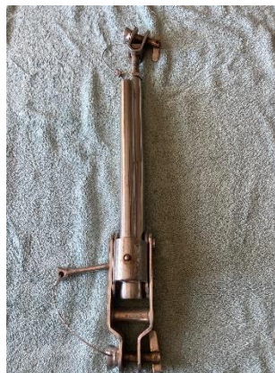
Removable stay fitting Used from Caliber 40LRC inner forestay Attached via 1/2 inch clevis pins to deck and stay - $150