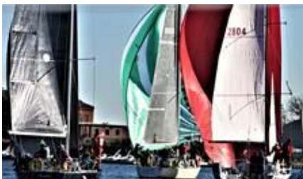
Gabooners with similar starting times head out from the starting area.

TO SEE THE COMPLETE RACE ANNOUNCEMENT (which includes the race course) and OBTAIN ENTRY FORM and INFO: CLICK ON https://www.hamptonyc.com/regattas-registration and scroll down.